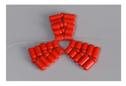
Tie the smaller petals together. Add 1x R between each RO1. Thread the line through 2x. This time pull the line into the surrounding RO1 and R.