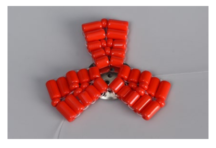
Step 14: Sew the FPB o the sieve above the central holes. Sew through it 2x. Tie off and cut the line.