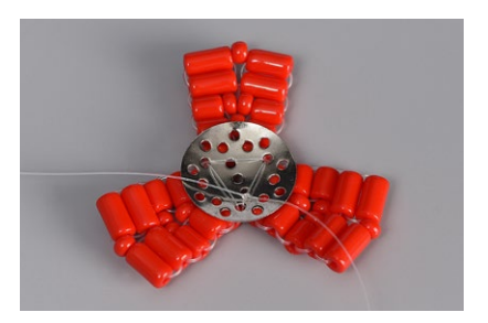
Step 12: Sew the larger petals to the sieve. Use the nine holes nearest the center. Attach the petals with the line in every 3<sup>rd</sup> hole of the sieve. Tie them on the rear of the sieve.