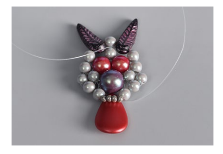
Step 11: Thread the line around the circumference of the head and through the IP4 and PB1. Sew it in. Try to place the knot in the hole of the IP8.