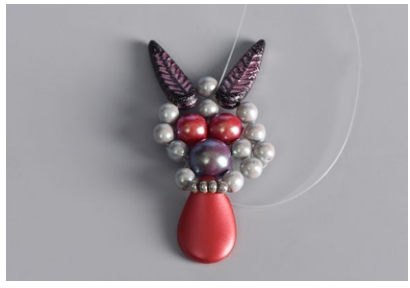
Step 10: Create the second cheek.