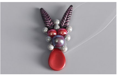
Step 7: Thread the line through the IP4. String 4x R. Place them behind the PB1. Thread the line through the second IP4 and the IP8.