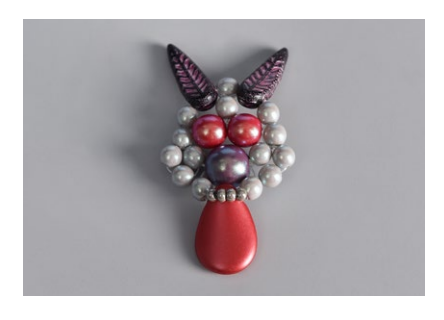
Use the head as a decoration. It can be hung or stuck on.