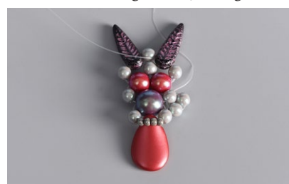
Step 9: Thread the line through the IP4 and PB2 and add 1x IP4 to each gap in the upper circumference of the head.