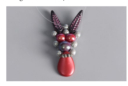
Step 8: Create the first cheek. Thread the line through the middle IP 4 on the side. String 2x IP 4. Thread the line through the IP 4 once again.