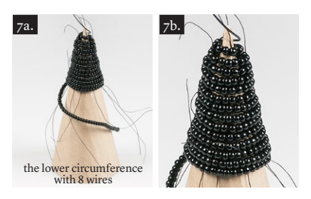
Affix another four wires to the fourteenth row with double loops. After completing the hat's point, this will be the sixteenth row. Continue winding another two rows (fig. no. 7a - 7b).

Remove the rocaille cone. Place it on the table and wind another four rows flatwise - this will create the brim.