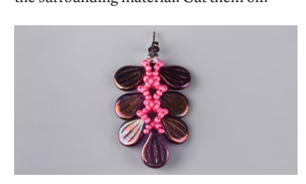
Design by Helena Chmelíková

PRECIOSA Rocailles 331 39 001; 8/0; 10/0