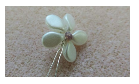
Step 12: Twist approximately 2 cm and continue with the second flower.