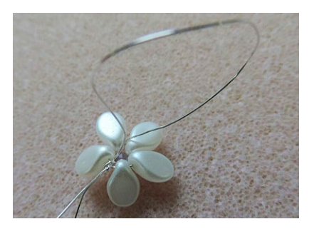
Step 11: Join the two wires and twist.