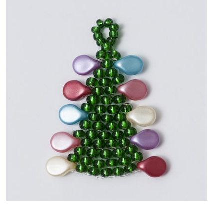
Step 10: Assembly Assembly Cut off 8 – 9 cm of chain. Attach it to the closing mechanism. Attach the first tree just below the mechanism using the first ring. Place the second tree at the end of the chain. Place the third tree in the middle of the chain. Place the IP on the eye pins. Link the IP in the free chain links; 8 IP directly in the links. Attach the remaining 6 IP using rings.