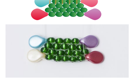
Step 5: Create the fifth, sixth and seventh rows. Proceed according to steps 2, 3 and 4. However, string one less R8 in the rows.